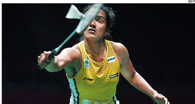
THE WAIT CONTINUES: World champion PV Sindhu

The season was suspended after the All England Championships on March 15 and was expected to resume with the TUC. However,